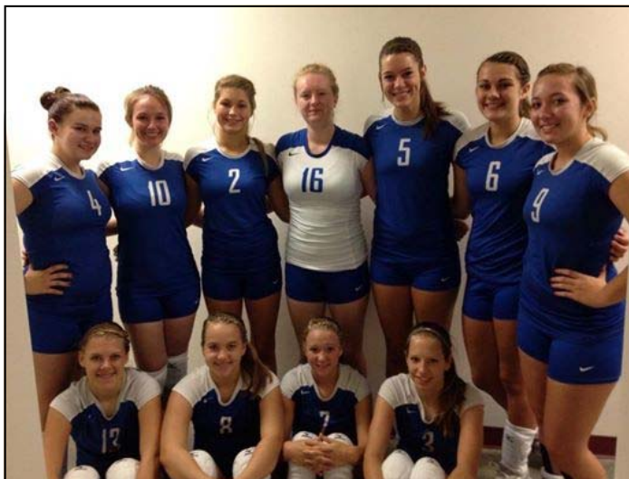
Members of the Lady Blue Dragons varsity volleyball squad who attended the pre-season tournament.

High hopes are given to the girls this year, but knowing their capabilities