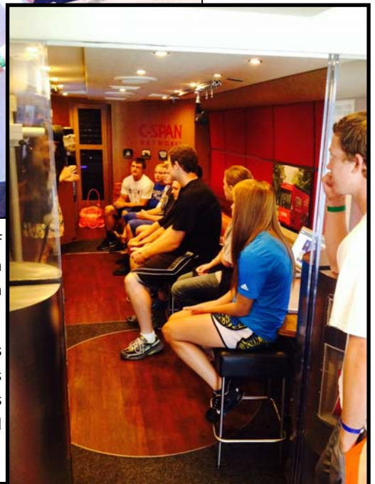
Right: Students attentively listen as the C-SPAN reps explain the bus and its purposes.